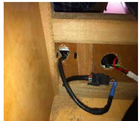
Do-it-yourself butchering? No: this is how wiring was allegedly installed in one brand new RV.

By and large, most RVs have grossly inadequate wiring: some are consequently almost transformed by upgrading the charging and fridge circuits alone.